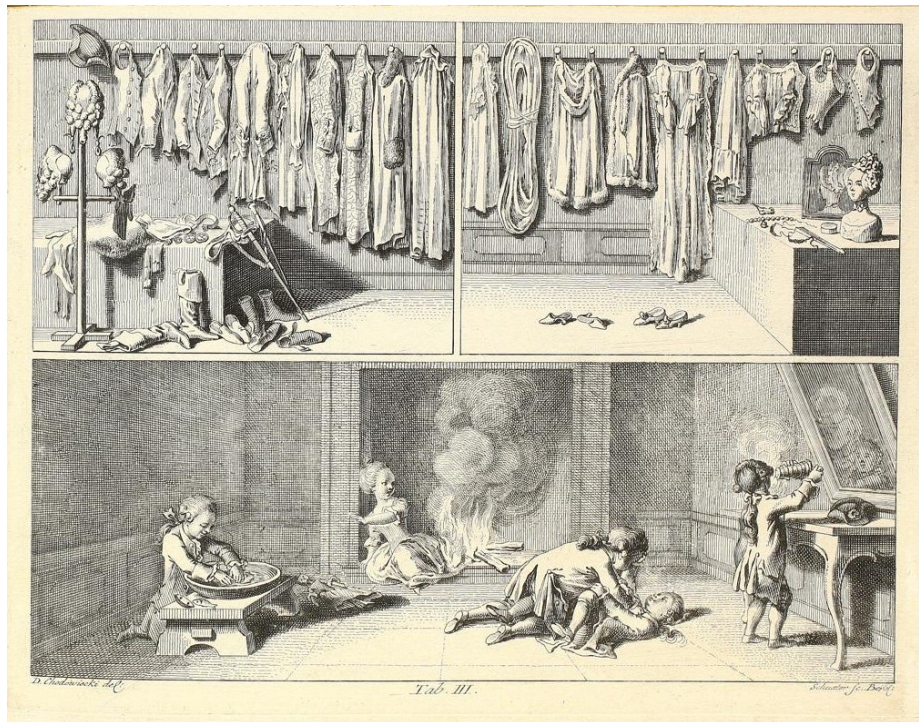
Tab. III. a) Examples of most of the different articles of clothing. B) Mistakes, whereby children spoil their clothes. Elementary Book XV .