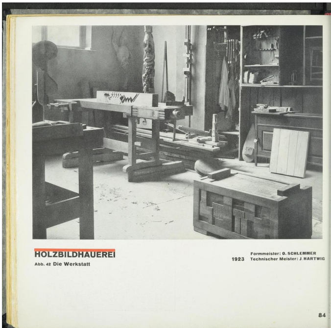
HOLZBILDHAUEREI Abb. 42 Die Werkstatt